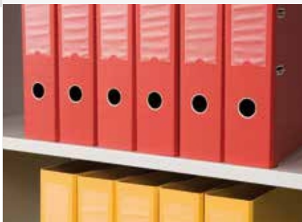
GTDSHELF 900 or GTDSHELF 1200 Standard plain shelf to fit 900 or 1200 width units. (max load 45kg). White or Silver Grey.