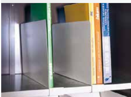
BS6D or BS9D Clip-on divider in 15\ 03mm or 230mm heights, for use with GTD Shelf. White or Silver Grey.