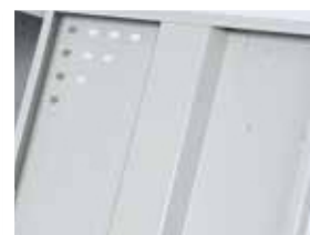
Full length door stiffener