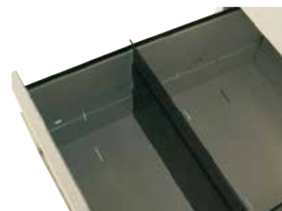
Compressor plate slots into drawer to divide vertically