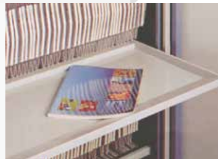
GG09PS or GG12PS Pull out filing shelf to fit 900 or 1200 width units. White.