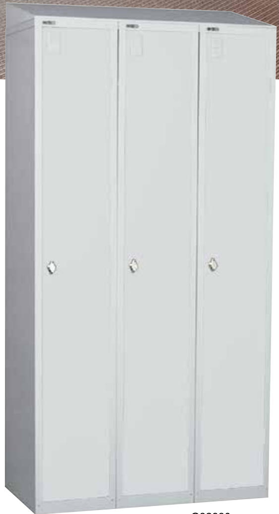
G32830 Bank of 3 sloping tops