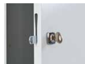
Cam lock with 2 keys fitted standard (master key series)