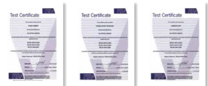
Filing Cabinets, Double Door Cupboards and Side Opening Tambour Units: Tested to BS EN 14073:2004 Parts 2-3 & BS EN 14074:2004

Quality, practicality and good aesthetics reflect the Company's commitment to be a major force in steel products.