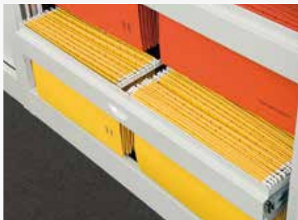
GG09FF or GG12FF Roll out filing frame to fit 900 or 1200 width units. Will take foolscap or A4 filing pockets. White.