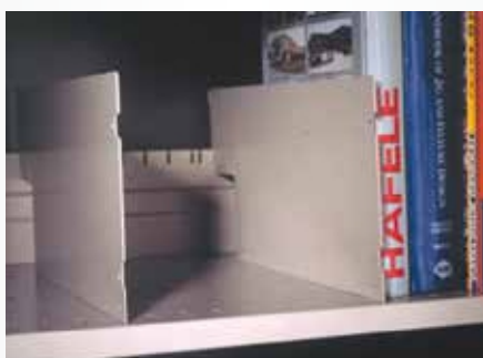
GG09SLOT or GG12SLOT + GS7D (pack of 5) Slotted shelf to take GS7D vertical dividers (sold separately) (max load 45kg). White