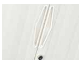
White on white finger grip