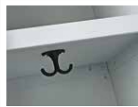
Coat hook and hat shelf (single door only)