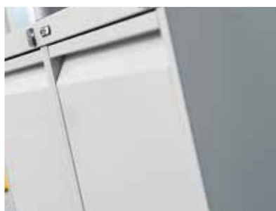
Swan neck handle