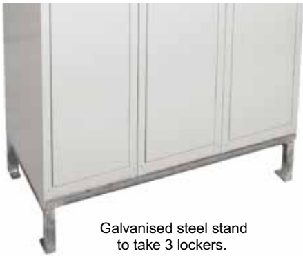
Galvanised steel stand to take 3 lockers.