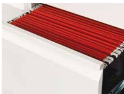
Smooth action suspension slides 100% drawer extension