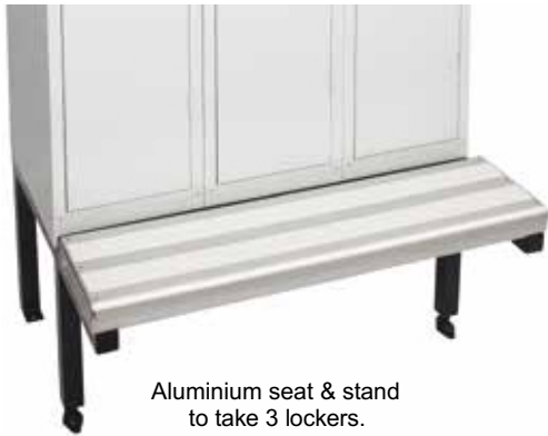
Aluminium seat & stand to take 3 lockers.