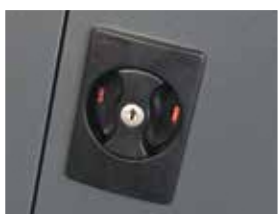
Twist door handle complete with 2 keys (master series)

The Go 2200mm high bay shelving comes complete with five shelves.