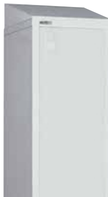
G12830 Single sloping top