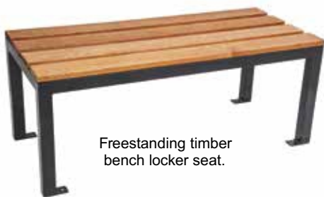
Freestanding timber bench locker seat.