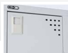
Air perforations (single door only)